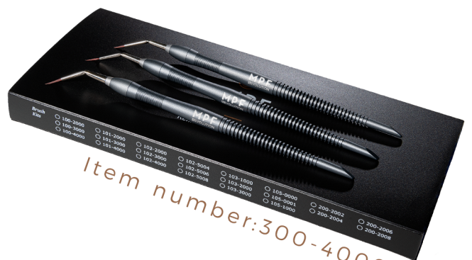
Item number: 300-4000