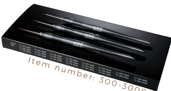
Item number: 300-3000