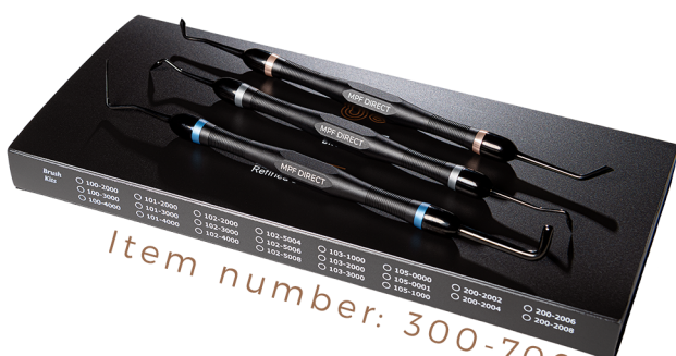
Item number: 300-7000