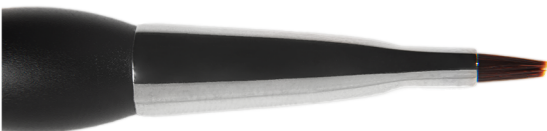
Item number: 300-5002A