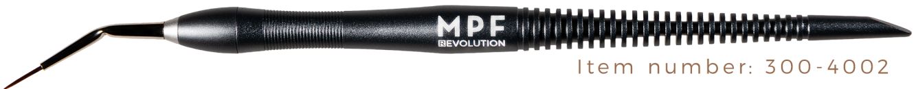
Item number: 300-4002