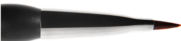
Item number: 300-5003A