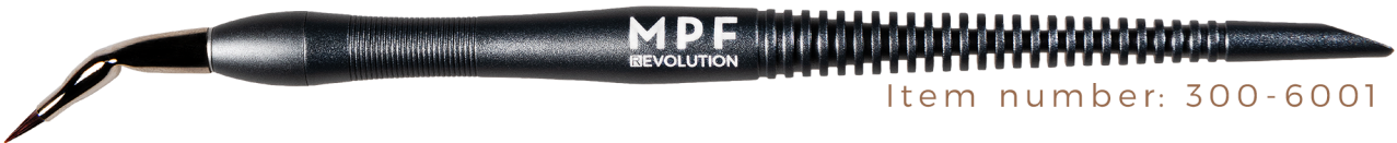
Item number: 300-6001