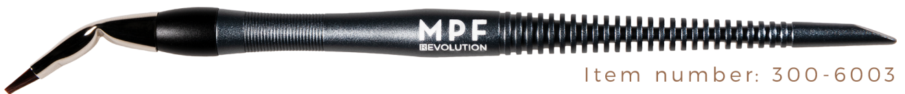
Item number: 300-6003