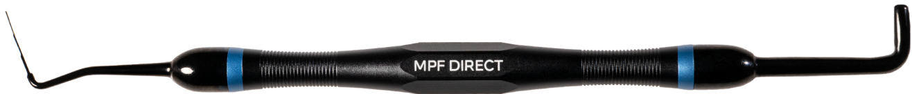
Item number: 300-7001

These tools are all autoclavable and can withstand any sterilisation process. They are NOT to be cleaned by using wire brush techniques as this can destroy the coating process. Care must be taken by using a soft brush to remove any reminiscence of composite material.