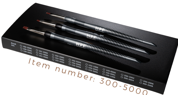
Item number: 300-5000