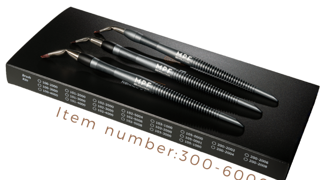
Item number: 300-6000