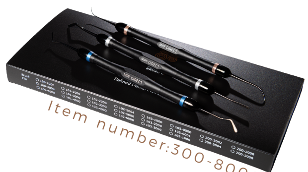
Item number: 300-8000