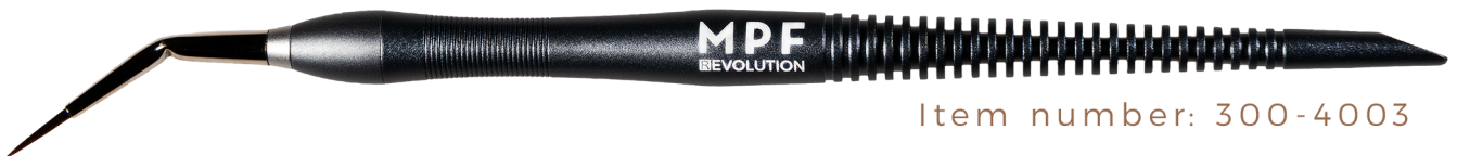
Item number: 300-4003